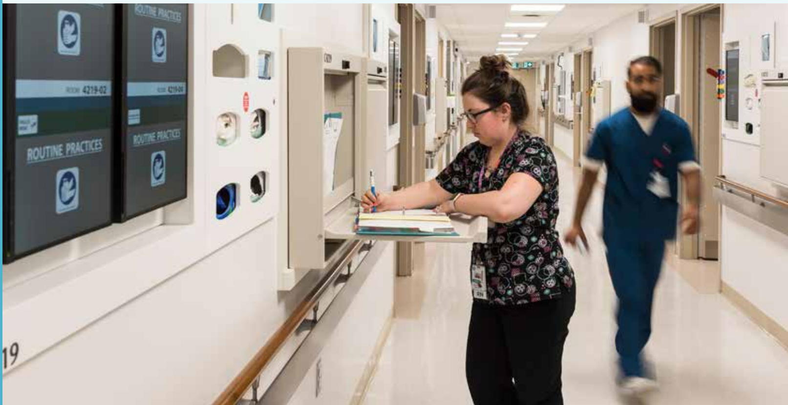
The C4 was fully renovated last year.

For QCH staff, the renovations enable them to adjust to future technological improvements, streamline their work, and address any safety issues they may have previously identified. The renovations are being performed with input from staff and patient advisory groups. Renovations will be completed on two additional units in the upcoming year.