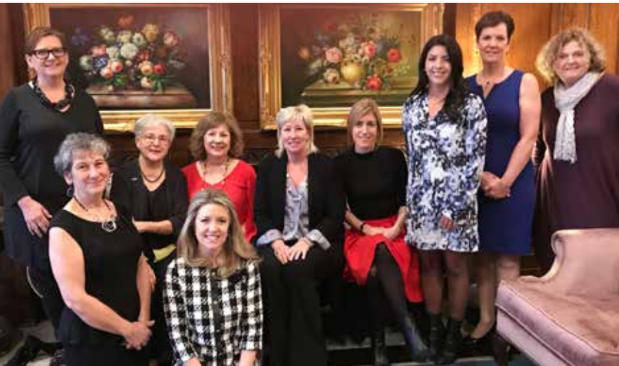
Founding members at the Women In Philanthropy launch, December 2018.