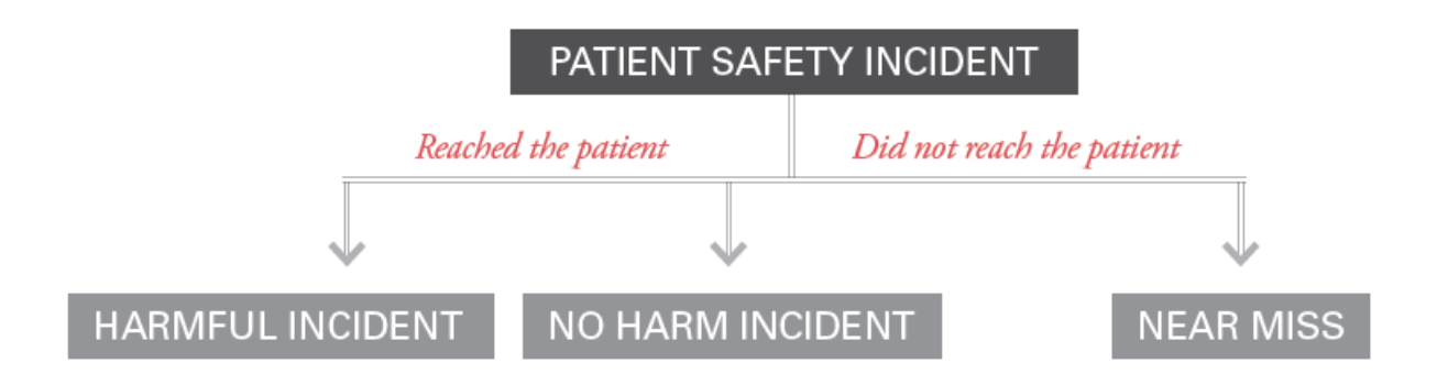
Diagram A: Relationship Between Terms

In the above circumstances requiring disclosure, QCH's process includes an apology/expression of regret to the patient and/or SDM. The Ontario Apology Act expressly provides that an apology made by or on behalf of a person in connection with any matter does not, in law, constitute an express or implied admission of fault or liability by the person. In addition, the legislation provides that evidence of an apology made by or on behalf of a person in connection with any matter is not admissible in any civil proceeding, administrative proceeding or arbitration as evidence of the fault or liability of any person in connection with that matter.